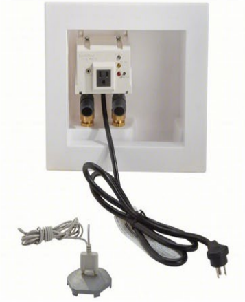
WATTS Washing Machine Smart Water Shutoff Valve and Wall Box: Water Shutoff, Polysulfone