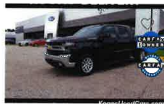
2019 CHEVROLET SILVERADO 15... Koons Ford of Annapolis