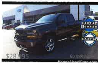
2016 CHEVROLET SILVERADO 15... Koons Ford of Annapolis