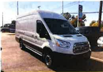
V RARE LONG WHEELBASE HIGH ROOF