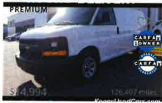
2013 CHEVROLET EXPRESS 150... Koons Ford of Annapolis