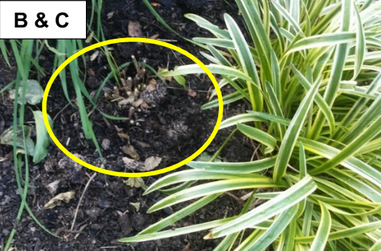
B & C